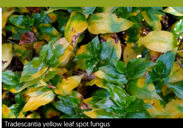
Tradescantia yellow leaf spot fungus

material and wedge this into tradescantia at new sites (but make sure you have an exemption from MPI that allows you to do this).